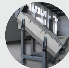
Inclined Friction Washer