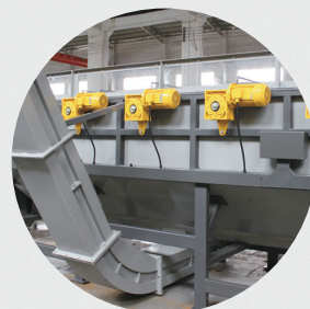
Float-sink Washing Tank