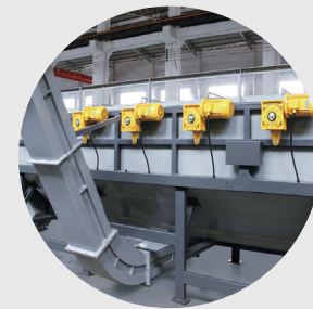
Float-sink Washing Tank