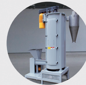
Vertical Dewatering Machine