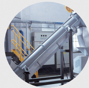
Inclined Friction Washer